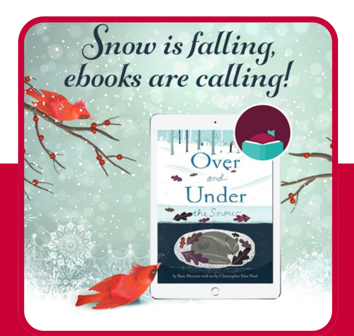
Scan to read on Libby!

December: A book with "old" or "new" in the title