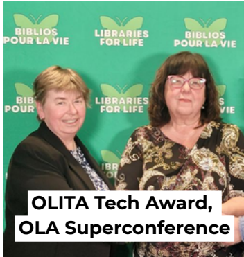
OLITA Tech Award, OLA Superconference