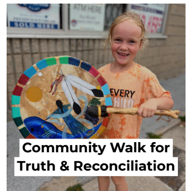
Community Walk for Truth & Reconciliation