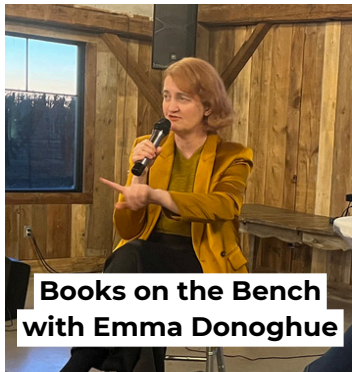
Books on the Bench with Emma Donoghue