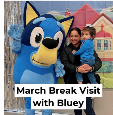
March Break Visit with Bluey