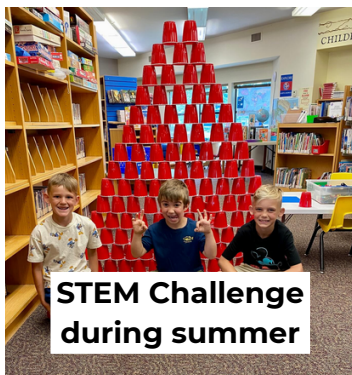
STEM Challenge during summer