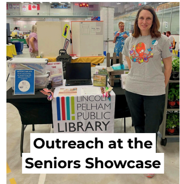
Outreach at the Seniors Showcase