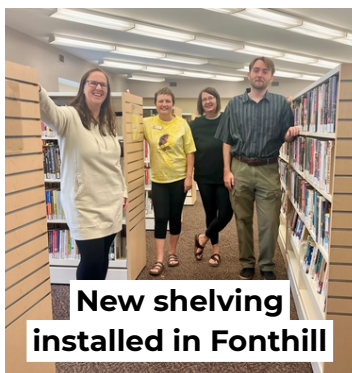
New shelving installed in Fonthill