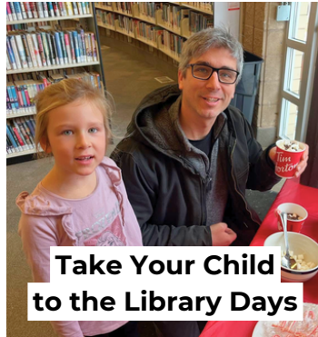
Take Your Child to the Library Days