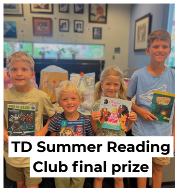
TD Summer Reading Club final prize