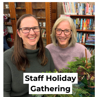
Staff Holiday Gathering